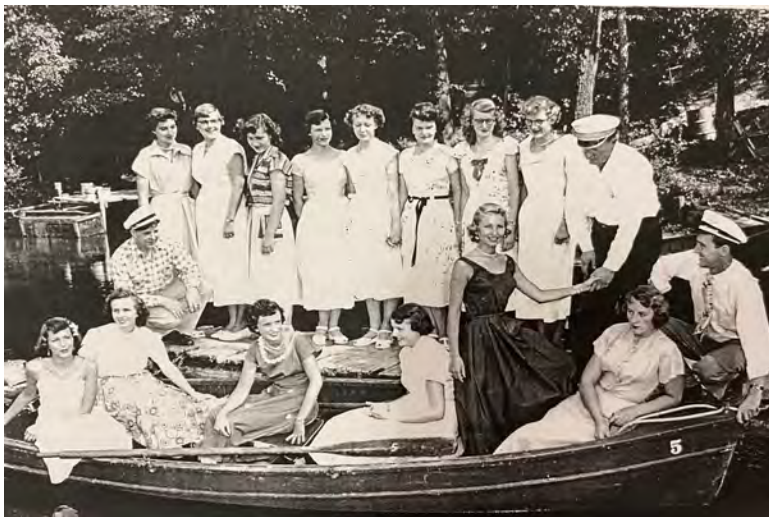
The candidates receive some "nautical instruction" from the admirals of the Balsam Lake Pageant Navy, as published in the Sunday edition of the Pioneer Press in 1950.