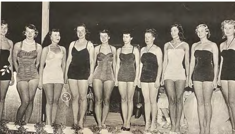
A photo of the candidates from the swim wear portion of the competition.