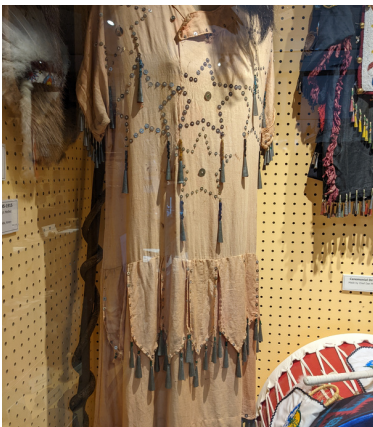
EXHIBIT SPOTLIGHT: JINGLE DRESS